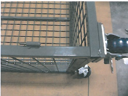
UNIT WITH DOORS, HINGES POSITIONED AS SHOWN.

Step 4: Install the back grid with the badge at the top of the unit facing in as shown. The long wires on the grid will slide into the center tube holes and the side panel holes. Once the two back grid panels are installed slide the sides with the back grid panels down onto the base. Tighten the 5 wedge nut bolts.